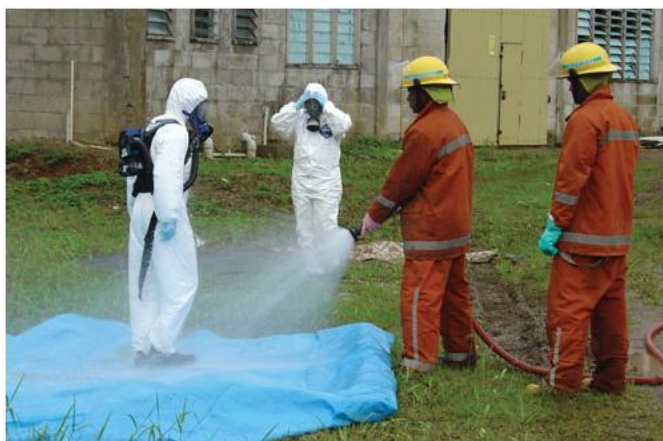
Fig 2. Lab officers getting hosed down by the fire brigade.

Getting to the bottom of whether or not your environment is affecting your health is likely to require toxicology tests. This may include blood tests although hair testing will show a much longer history of exposure. This is particularly true of methamphetamine, which clears out of the body very quickly.